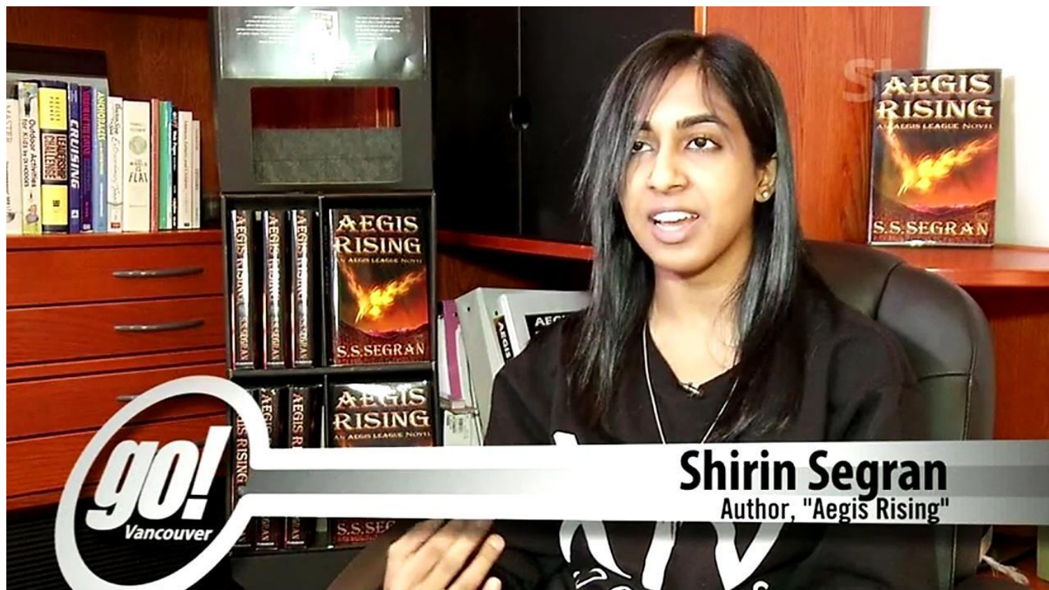
S.S.Segrán on Shaw TV's Go! Vancouver Show